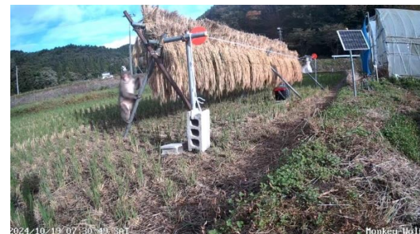
Monkey monitoring 2024.10.19