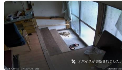
Watching the front door of elderly people's homes